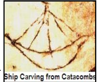
Ship Carving from Catacombs

Thus, when we talk about our church to others we should speak about the excitement of being the people of God in this place and the hopeful expectation of seeing where God takes us. Our mission is not to keep the doors open, but rather it is to open ourselves up to the dynamic power of the Holy Spirit!